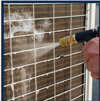
Fine or wide spray

to wash even the dirtiest coils, without damaging sensitive fins. And the small portable size lets you clean coils from the front or back of the coil – a proven method for increasing coil cleaning and system efficiency. CoilJet makes cleaning coils quick and easy. Now that's smart.