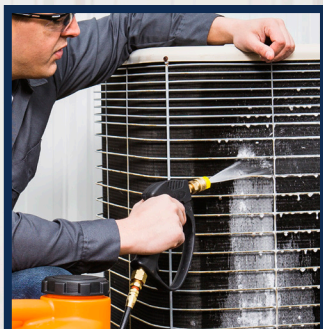
Easy cleaning in any situation